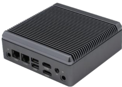
* Default without COM