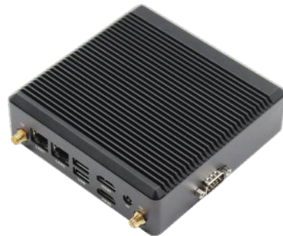
* Customized options with COM(1xRS232)

Copyright © 2022 Maxtang Technology Co. Ltd. All rights reserved. All data is for information purposes only and not guaranteed for legal purposes. Information has been carefully checked and is believed to be accurate however, no responsibility is assumed for inaccuracies. Maxtang and the Maxtang logo and all other trademarks or registered trademarks are the property of their respective owners and are recognized.